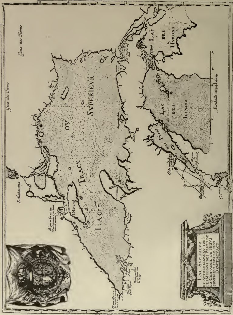
JESUIT MAP OF LAKE SUPERIOR—1670-71.